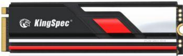
PCIe 4.0 XG7000 PRO Series