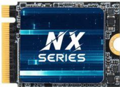
PCIe 3.0 NX Series